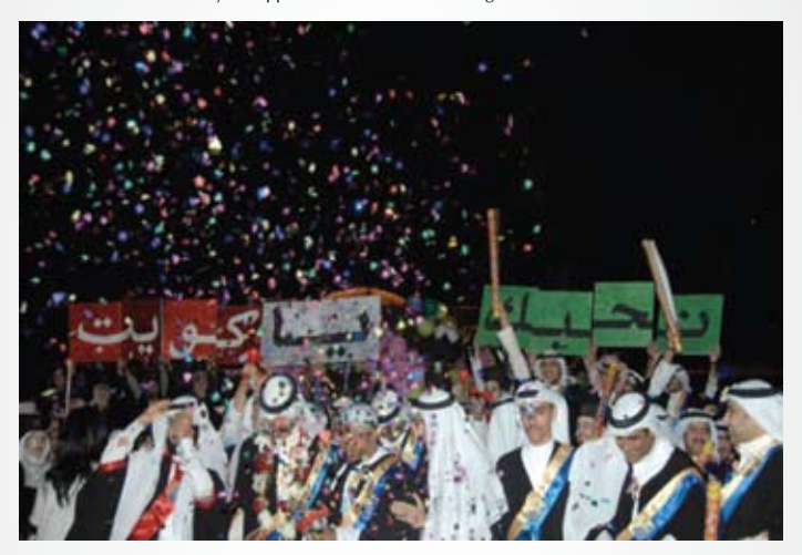
Eradication of Illiteracy and Adults Education Centers