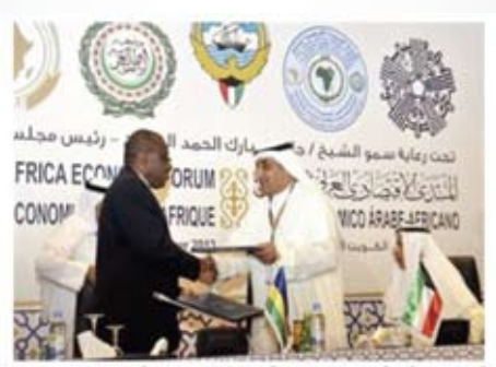
وقيع الصندوق الكونس للتنمية الاقتصادية العربية اتفاقية مع جمهورية رواندا